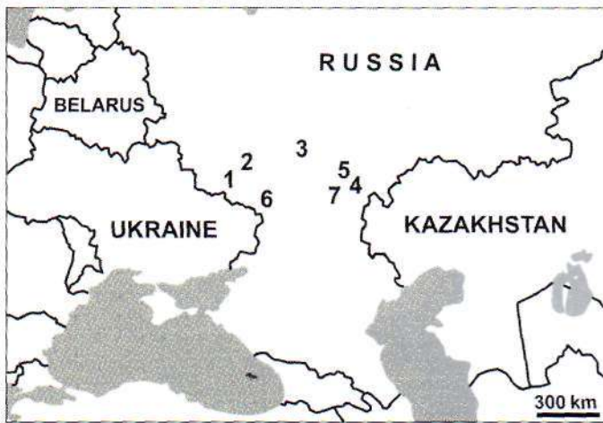
Fig. 1. Map of southern European Russia and adjacent territories showing mid-Cretaceous pterosaur localities in Russia: 1, Lebedinskii and Stoilenskii quarries; 2, Strelitsa; 3, Kobyaki; 4, Sinen'kie; 5, Saratov; 6, Pavlovsk; 7, Melovatka 3.

locality in the Volgograd Region (personal communication to the first author 2002).